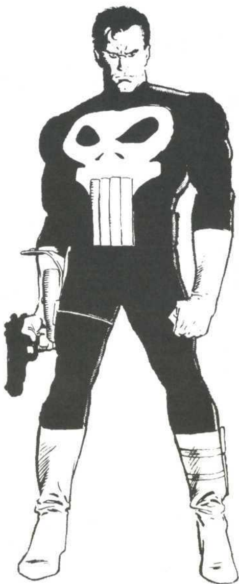
Artist's rendering of "The Punisher" from eye-witness accounts