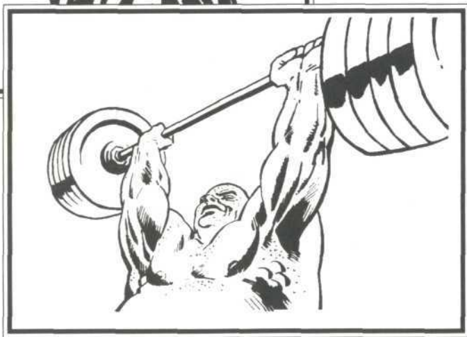
Wilson Fisk aka "Kingpin"

photographed by secret cameras (not sanctioned by court order) in his Manhattan HQ